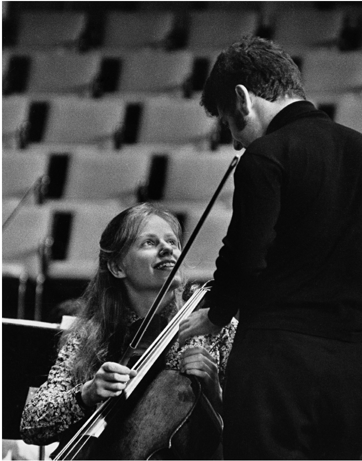
Daniel Barenboim and Jacqueline du Pré, 1972