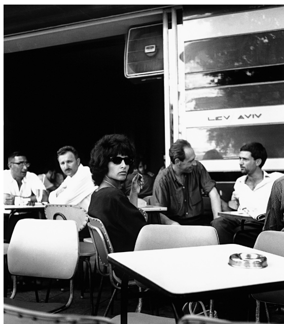
Dizengoff Street, Tel Aviv, 1963